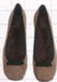
SHOES Indigo by Clarks flats, $65