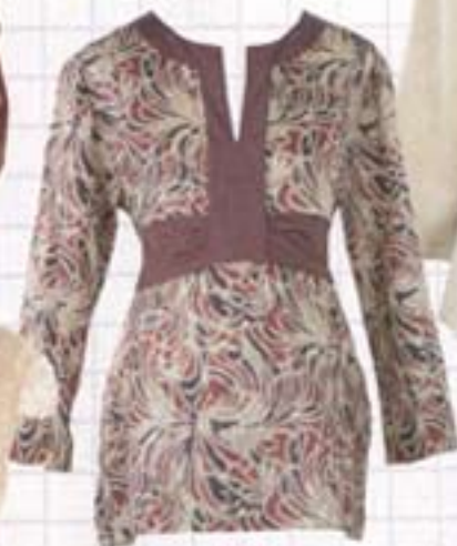
TOP Cadeau print tunic, $195