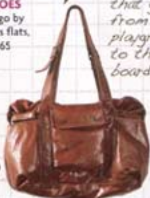
BAG Not Rational diaper bag, $599

Every girl needs a bag that goes from the playground to the boardroom.