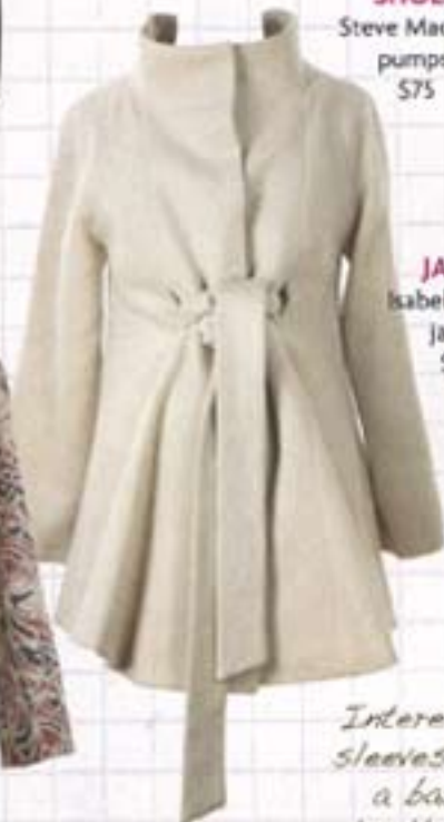
JACKET Isabella Oliver jacket, $330

Interesting sleeves take a basic turtleneck to a chic new level.