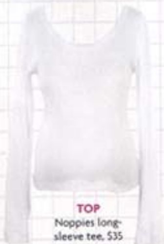
TOP Noppies long-sleeve tee, $35 (at belly elan)