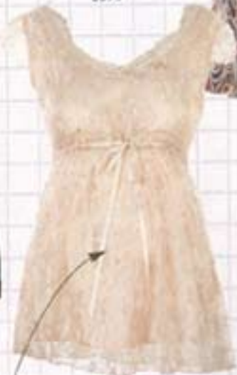
TOP Lauren Kiyomi lacy top, $84

Interesting sleeves take a basic turtleneck to a chic new level.