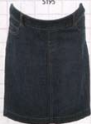
SKIRT babystyle denim pencil skirt, $58

This girly top adds a little oomph to any basic outfit.