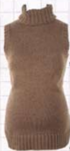
SWEATER Belly Basics sleeveless turtleneck sweater, $54