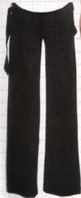
PANTS Isabella Oliver trousers, $135

Every girl needs a bag that goes from the playground to the boardroom.