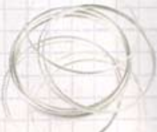
BRACELETS Xhilaration bangle bracelets, $7 for set