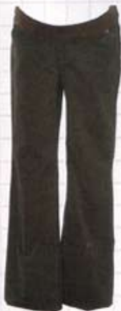
PANTS MamaBlack corduroys, $80 (at Pickles & Ice Cream)