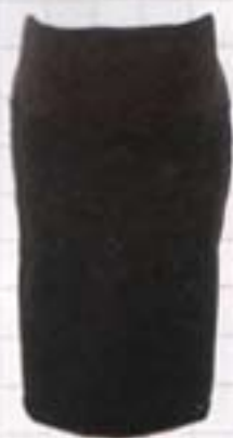
SKIRT Leighlani Maternity skirt, $70