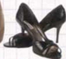
SHOES Steve Madden pumps, $75