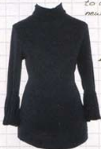
TOP Maternal America lantern-sleeve top, $68 (at Unbuttoned Maternity)